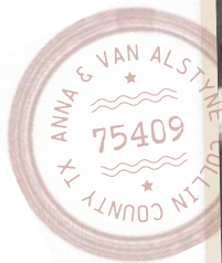
Mantua was founded on 200 acres in 1854 for the purpose of establishing a school.

It began with 25 acres, a town square, and the promise of a bright education. Back in the 1800s, before Anna and Van Alstyne, Texas were the towns they are today, there was a settlement called Mantua. Its story intersected iron horses, Texas’ founding fathers, and some of our earliest railroad towns. Now, the spirit of Mantua’s legacy lives on through an almost 2,000-acre master planned community where every resident can build a future rooted in heritage and opportunity for generations to come.