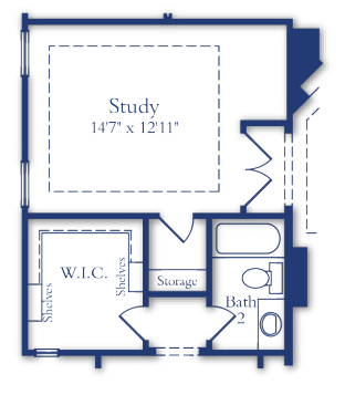
Opt. Study ILO Bedroom 3