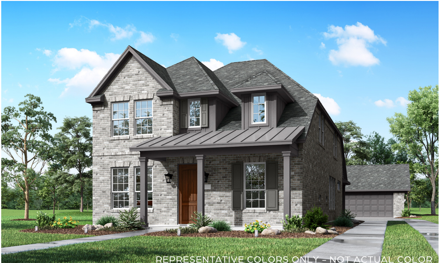
REPRESENTATIVE COLORS ONLY - NOT ACTUAL COLOR