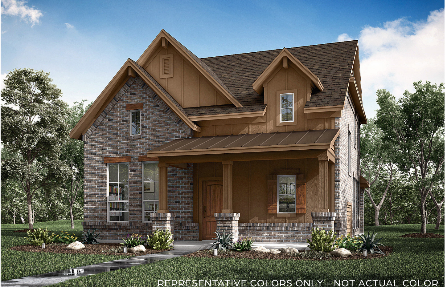
REPRESENTATIVE COLORS ONLY - NOT ACTUAL COLOR